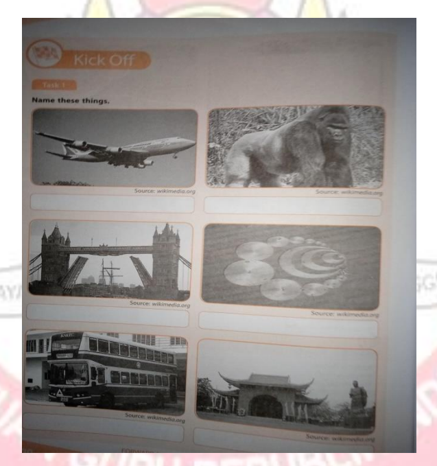
Figure 4.1.1.1. The teacher teaches the material in the picture above.

In the whilst activities, the teacher starts by instructing students to open student books with chapters that explain the factual report. In the student book, there are various kinds of pictures, and students are asked to answer any names in the picture. This is an example: