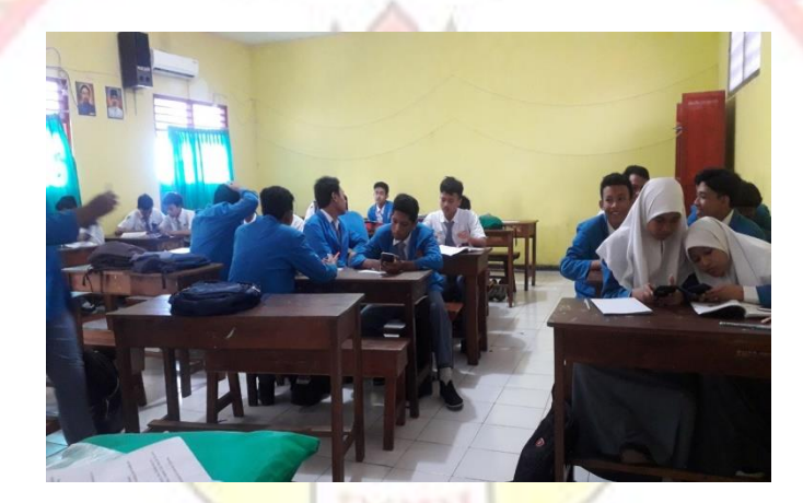
Figure 4.1.1.2. This is a photo of when students are in groups.

In the whilst activities, the teacher explains a little of the material discussed in the first week's meeting about factual reports and QAR strategies. Then the teacher instructs students to create groups. In class, there are 4 rows 1 row divided into 2 groups. After completing the grouping, the teacher instructs students to look for factual report texts and make questions in the types of questions in the QAR strategy.