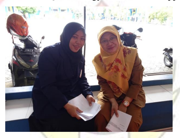
Figure 4.1.1.3. The researcher interviewed the teacher

After learning is finished, the researcher interviews the teacher about the factual report material and QAR strategy that have been applied to students.