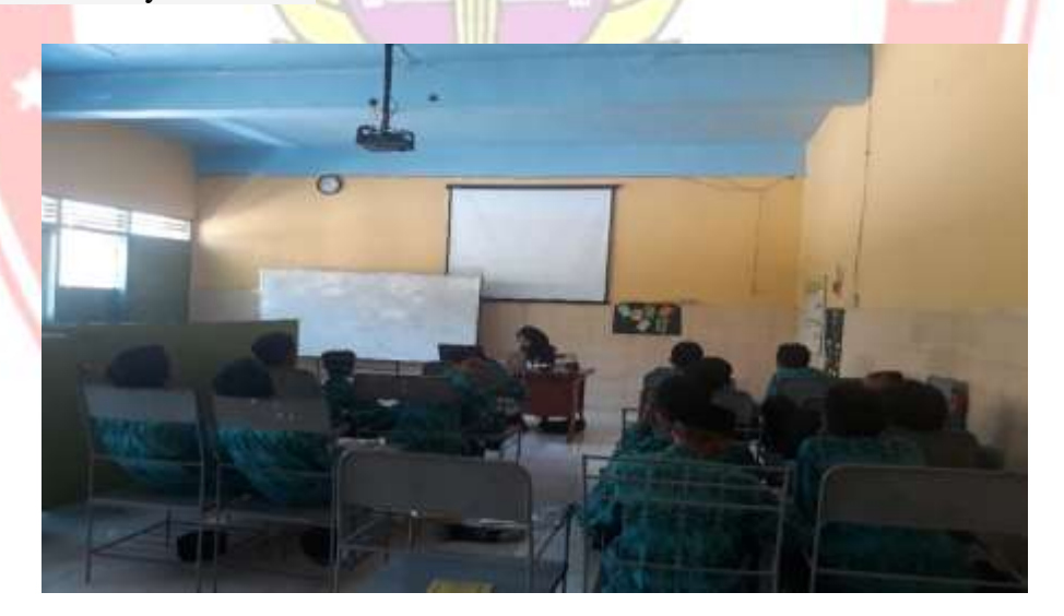
4.6 Picture Student Work In Pair About Wonderfull Indonesia

After the teacher asked student understanding, the teacher asked students to choose one picture about tourism place in that book then work in pairs to make a simply dialogue for understanding with the responses in English. The teacher gave opportunities for the students to ask question when they found difficulties in using the word. After that, the teacher corrected the students when they mispronounced some words and asked them to practice pronouncing it. She also corrected the grammar and pronunciation mistakes only if the sentence were not understandable. All of the correction was directly done but not often in order not to discourage the students. To speak in addition, the researcher always appreciated the student's participation by saying "good" in order that the students were always motivated to be active to speak English without any hesitation.