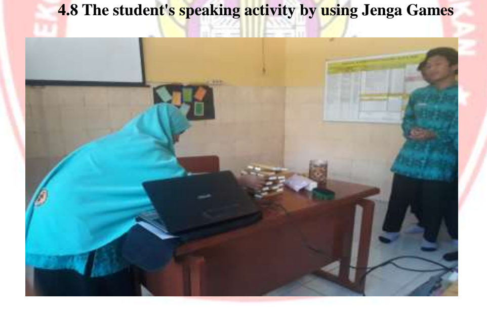
4.9 Picture of the student's play Jenga Games

Teacher: Good job, next student please play Jenga Games.