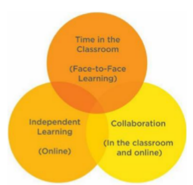
Figure 1. Blended Learning Concept