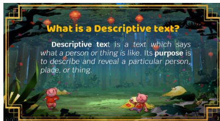
Picture 1.4 The definition of descriptive text

The teacher explained to the students that today they would learn new material. Before starting the explanation, the teacher showed the material in the slide, the teacher gave information and the students paid attention to the slide of power point.