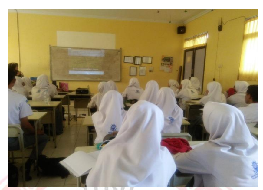
Figure 4.1.3 The teacher showed the BBC news video

After the video has finished. She asked the students about the videos.