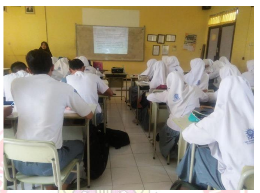
Figure 4.1.2 The teacher explain the news item text

news item text and asked the students to analyze the generic structures and the language features.