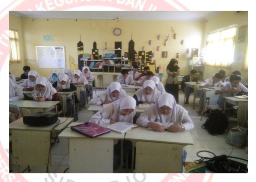
Figure 4.1.1 The students recite Al-Qur'an

In SMA Muhammadiyah Tulangan, every morning at 6.30 the students had to recite alquran together while hearing the students who recite al quran using aid audios as guidance. The teacher checked the students to make sure the students brought al-quran and recited al-quran together. After that the students prayed together.