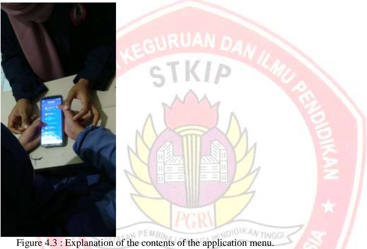
Figure 4.3 Showed that the teacher gives an explanation of each of the content menus that are applied, and students are focused on selecting applications on the grammar menu.

Figure 4.2 Showed that the teacher asks students to prepare cellphones and after that students must download the application from Playstore or can transfer to each other via a Bluetooth device, after that each student must open the application on the main menu display or the main logo of the English Grammar Learn & Test application.