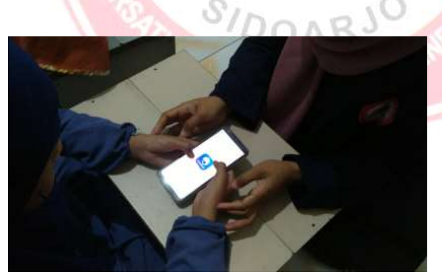
Figure 4.2 : Explanation image of the application logo opening.

Figure 4.1 Showed that the students got the explanation from the teacher about how to use application in learning Simple Present Tense. The teacher explanation made the students understand well about the use of the English Grammar Learn & Test Application. And each recorded the important points of Simple Present Tense. As a result, their grammar competence were developed by using the application regularly.