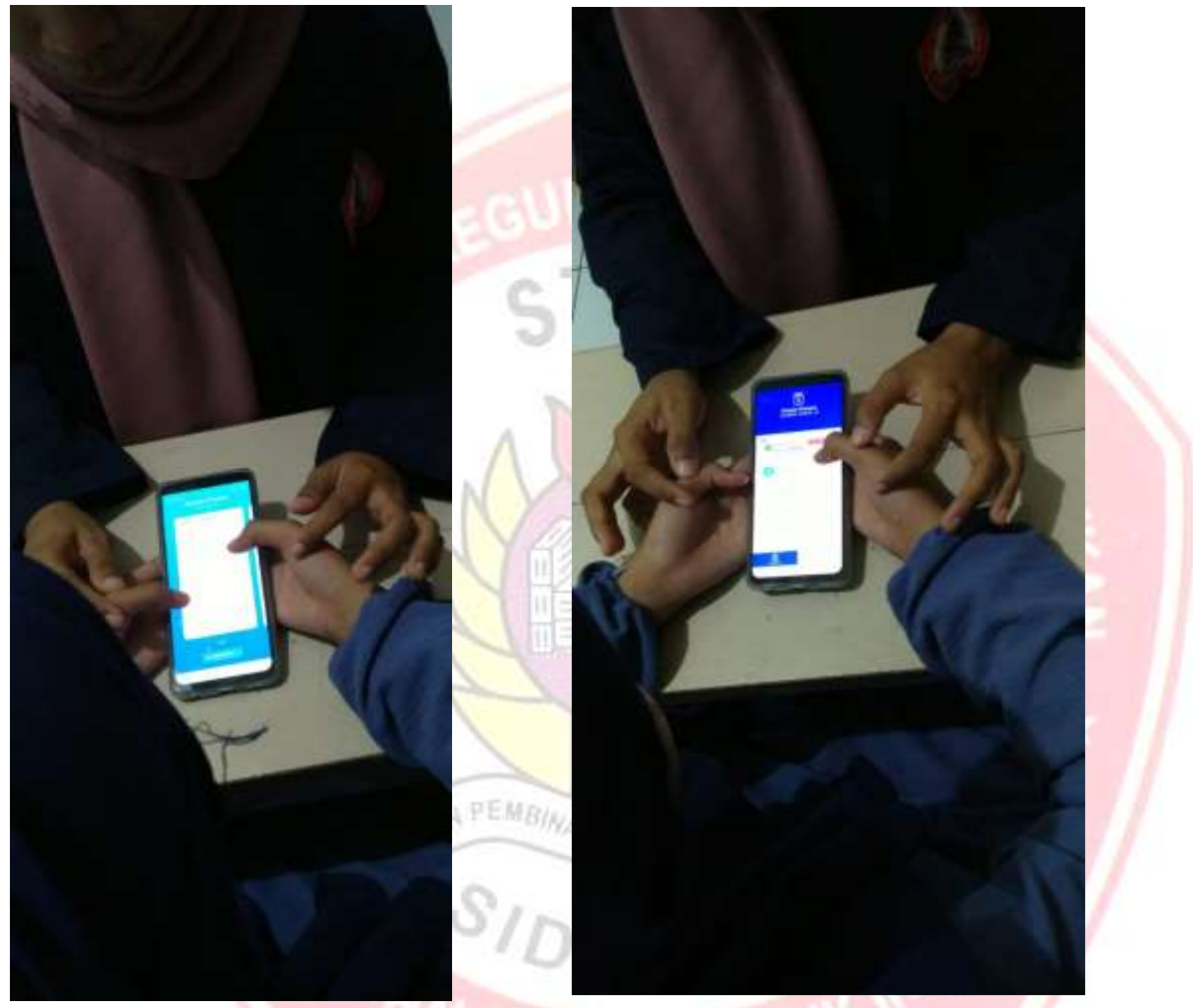
Figure 4.4 Menu question photo.

above to complete them well, and then fill out the observation checklist. And after that, a questionnaire was distributed to find out the improvement of each student after using the application.