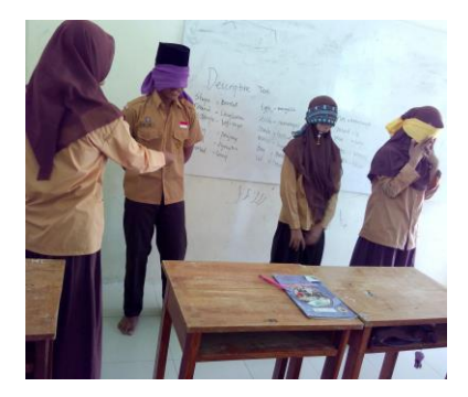
Figure 4.1.1.3 Blindfold Game Activities