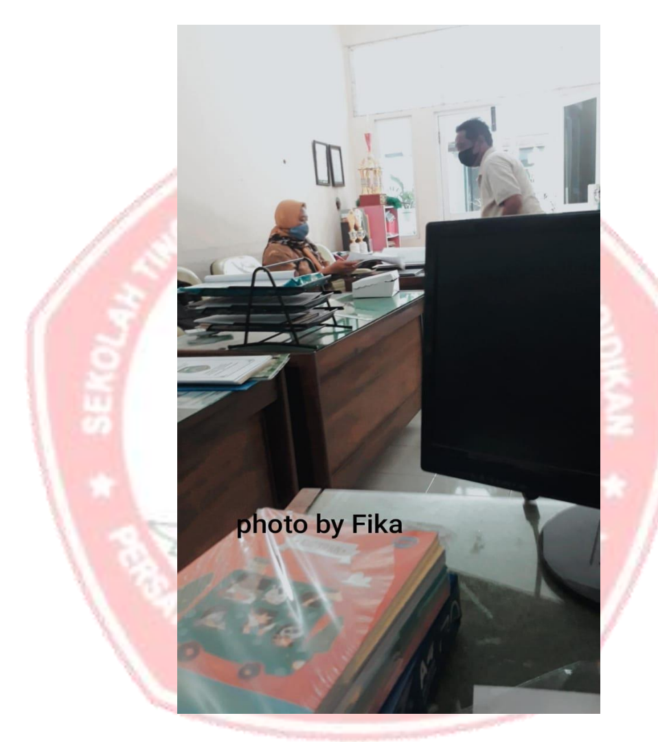
Picture 4.2 the researcher wait for the English teacher to disscuss material

rabbit out of his cage. 6) he used to jump everywhere and hard to catch. 7) So, I could just put him on his cage because I'm afraid that he might running away. 8) I don't want to lose my rabbit because I love him very much.