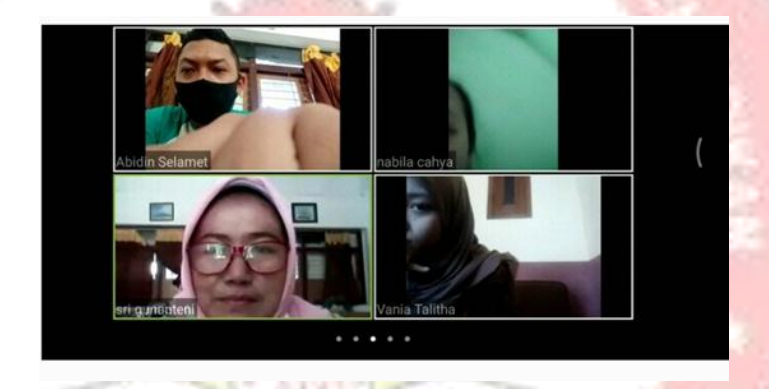
Figure 7. The researcher Joined in online meeting class

The researcher described the observation from the result of the observation check list in teaching writing report text through online. The researcher present at online meeting as an observer and helper in Zoom Application meeting . The researcher was joining and when the teacher was implementing Problem Based Learning in teaching writing report text to the ten student of ninth grade of SMP Hang Tuah 1 Surabaya through online meeting class ( figure7 )