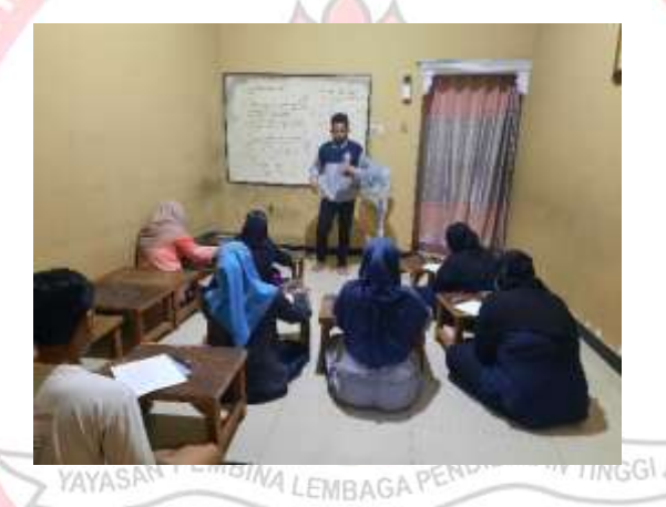
Figure 4.1.1.1 Teacher's Explanation in the First Meeting

lesson, consisted of eight females and two males. The teacher started lesson by greeting "Assalammu'alaikum, Good Night students ." After that, the teacher introduced the researcher to the students and told them that the class would be observed. He explained to the students the researcher would attend their class for several meeting. Furthermore, the teacher gave a stimulation to the students' interest in learning english. Therefore, the students would be more interesting and enjoy the class. The teacher started to explained about hortatory exposition, starting from definition of hortatory exposition, generic structure, language features and also a example.